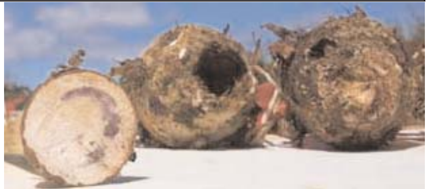
Lililohimolina, the table taro with bicolor corm at left. At right, samples of loliloli overripe taro]

A book, Taro Mauka to Makai, A Taro Production and Business Guide for Hawai'i Growers , is available from the University of Hawai'i and is a guide with photos, charts and recipes. At the end of the day, the field was almost ready for the next project. People went home to cook and plant some taro -- for the future.