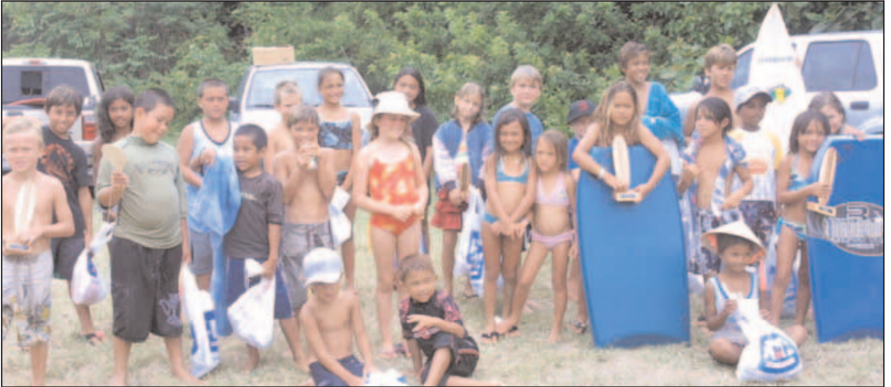
Most of the participants in the three-event series are pictured at the award ceremony on July 14th, with goodie bags, trophies and body boards and surfboards

Volume 23 Number 28 The Militia of Molokai's Community Newspaper—Every Wednesday July 25, 2007