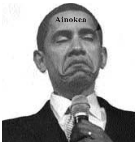
Defendant Obama is named as "de facto president of the United States."

The HSA Withdrawal Tax Hike. This provision of Obamacare increases the additional tax on non-medical early withdrawals from an HSA from 10 to 20 percent, disadvantaging them relative to IRAs and other tax-advantaged accounts, which remain at 10 percent.