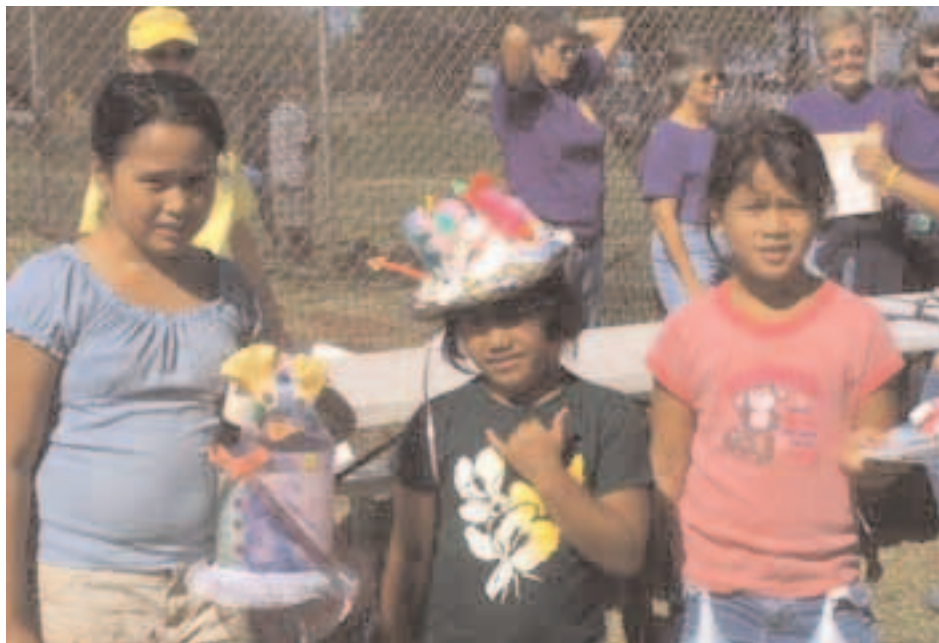
photo below - Easter Bonnet and Easter Basket winners showed creativity and color -- and got cash prizes from the Lions Club.