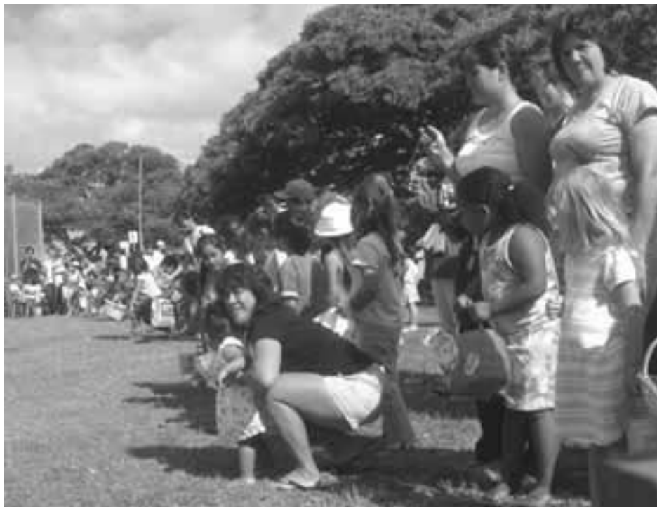
photo at right - 4-7 year olds and a few 1-3 year olds who missed the early start of the 1-3 year old egg hunt.