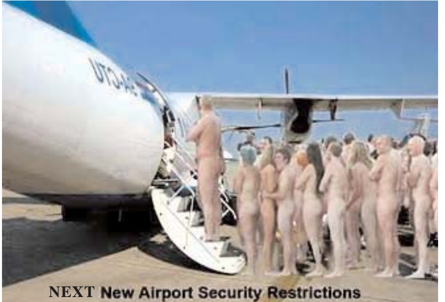
NEXT New Airport Security Restrictions

Also, it is now confirmed by USWGO News that the DSM-IV-TR Manual labels free thinkers, non conformers, civil disobedient advocates, those who question authority of TSA and Obama, and people considered hostile toward the Obama Regime, i.e., Oath Keepers and local Militias, as mentally ill called "oppositional defiant disorder" or ODD.