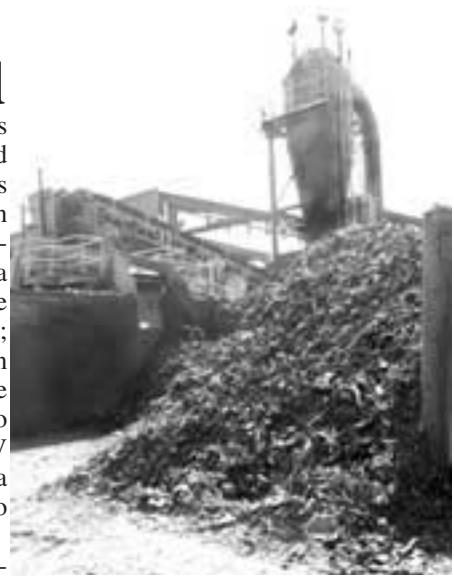
above: aluminum, copper and brass separated from iron scrap. below: all iron nuggets ready to ship.

While this recycling is very expensive, it is much cheaper than mining ore, and helps conserve landfill space and preserve our environment and resources.